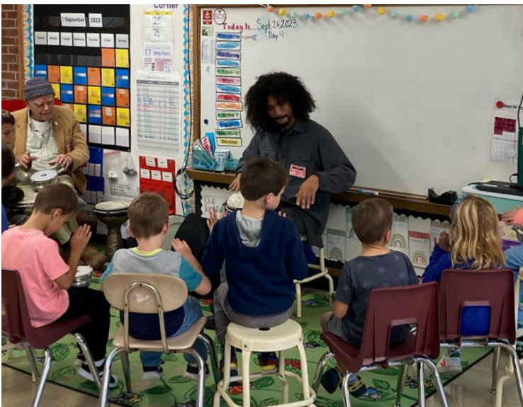
Drumming with The Music Cellar