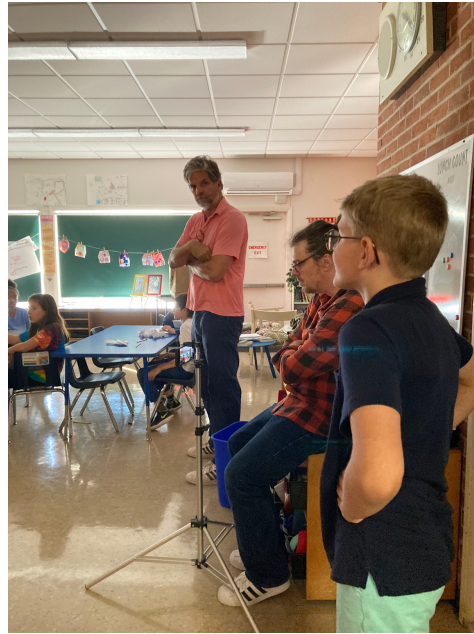
Intro. to Film Making with The Moviehouse