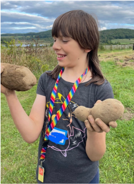
Food, Farming, and Fun at Fairfield Farm