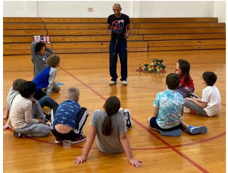
Circus Arts with Matica Arts